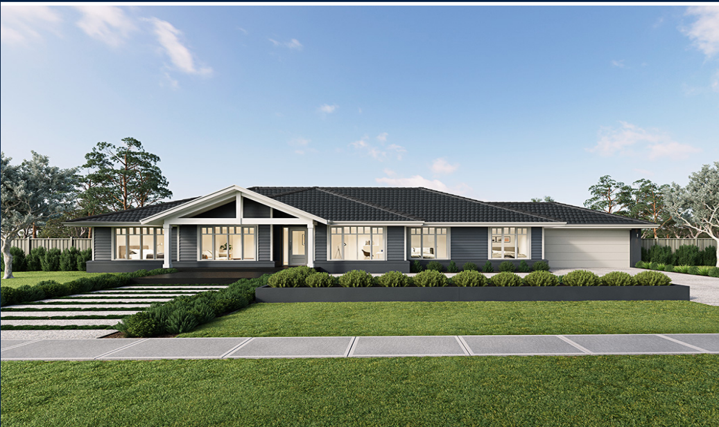
Price excludes upgrade items above standard specification such as feature render and bricks, front entrance timber decking, front entry door, brick infills above garage, external lighting, fencing, concrete paths and driveway. Façade Image may also contain items not supplied by Metricon Homes, namely landscaping and planter boxes.